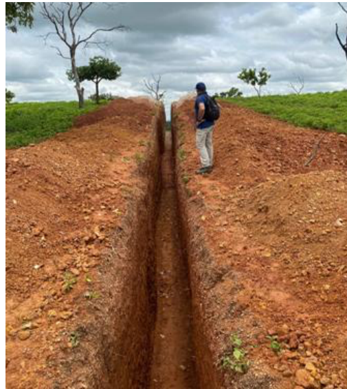
A view of two of the eight trenches.