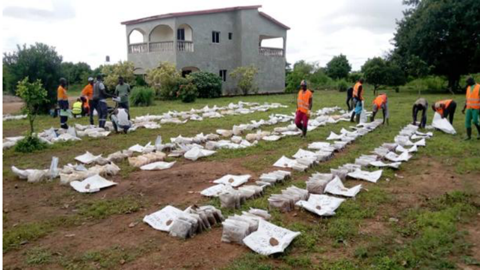
Samples to be sent to Coremet for metallurgical test work.